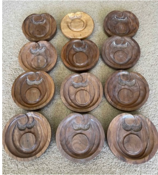
2026 Sustainability Award Plaques - Club Project