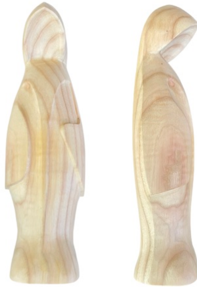
Two views of Sonja's excellent finished "Faceless Monk"; her first carving project.