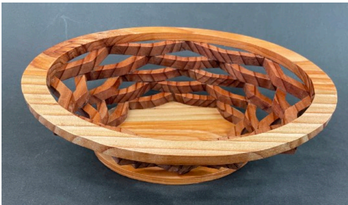
Above: A selection of photos of Members recent craft work.