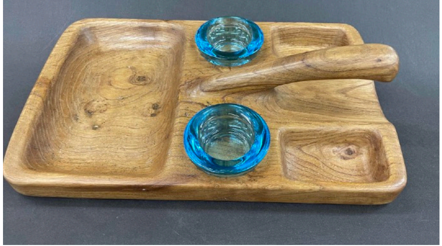
Barwick's Serving Platter