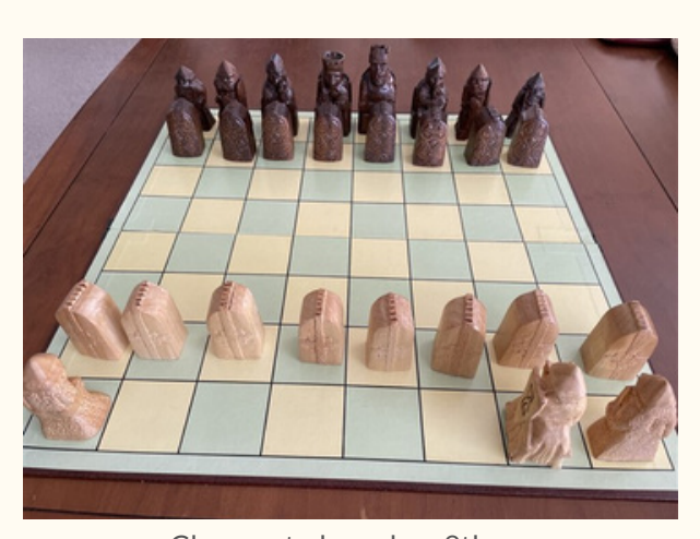
Chess set - based on 9th century figurines Phil Hansen