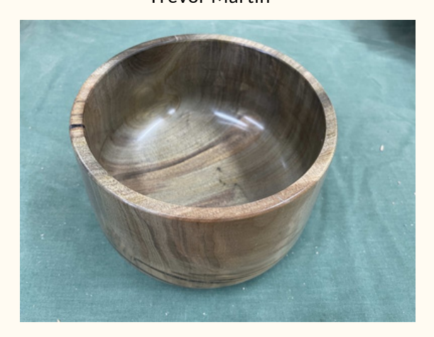
Bowl with resin - swamp kauri Roy Tregligas