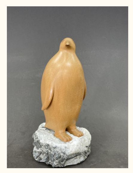
Emperor Penguin - kauri mounted on stone Fraser Pengelly