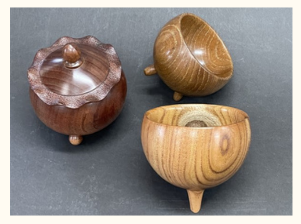
Bowls with legs/lid Derek Kerwood