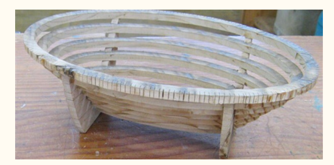
Distressed Basket Gavin Bell