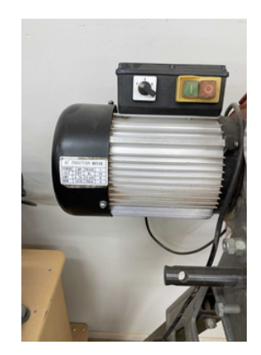
Lathe for tender. Click here for more details.