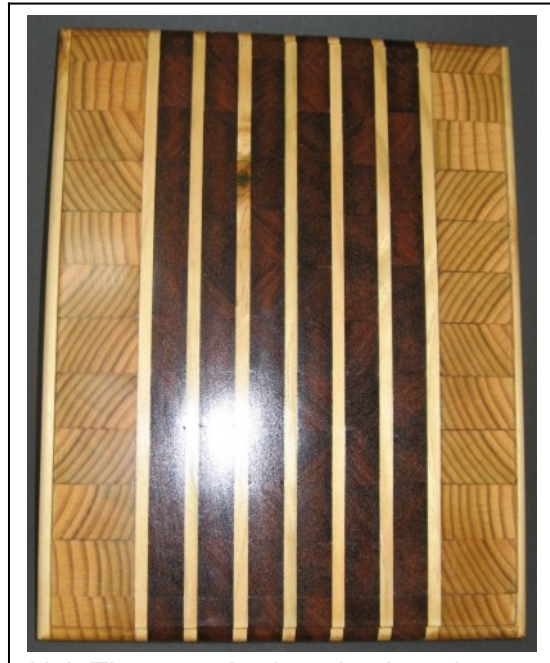
Hob Thompson's chopping board