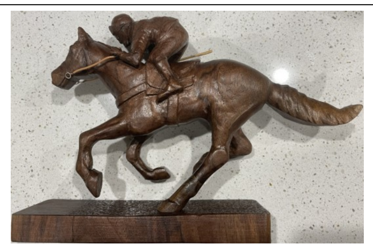
Almost completed carving in swamp Totara with a Danish oil finish

Our proposal is that our artwork will be a representation of the Maori legend of Tane. The three baskets of knowledge, which we have submitted, is very appropriate for a library setting in a multicultural community. Our allocated task will involve a group of Guild members in the making of three sculptural carvings (of the baskets) using black walnut timber taken from a tree felled in Omokoroa by WBOPDC. To help us, we were given a piece of the timber to make a "test piece" carving with an appropriate Maori kete/basket design and pattern. The carving work was done during March and gave us a basis for us developing the fee estimate for the proposal. The proposal has been sent off, and we are now waiting for the client's review and responses.