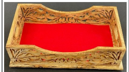
Duncan Campbell's fretwork tray