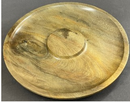
Roy Tregilgas' swamp Kauri platter