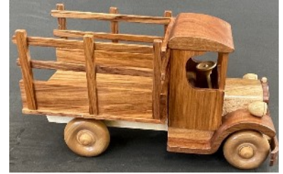
Mike Buck's traction engine and vintage truck