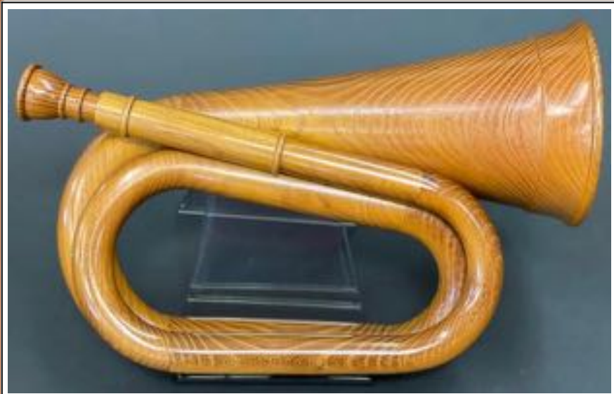
Derek Kerwood's beautifully crafted, playable bugle