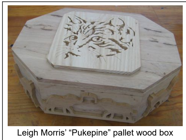
Leigh Morris' "Pukepine" pallet wood box

Allan Curtis for Duncan Campbell 543 2590