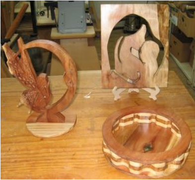
Gavin Bell's figures and baskets