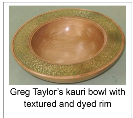
Greg Taylor's kauri bowl with textured and dyed rim