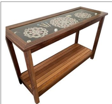
Doug St George's display table in black walnut and cedar

An interesting range of work was produced by members this month.