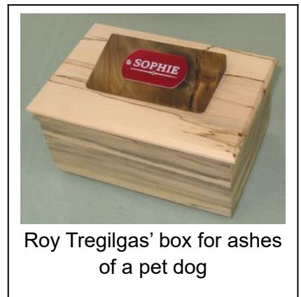
Roy Tregilgas' box for ashes of a pet dog