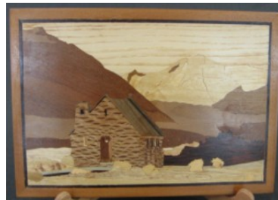
Allan Curtis' Church of the Good Shepherd, Tekapo