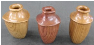
Derek Kerwood's series of vases (from left), 3 sided, 4 sided and circular

A good selection of projects were presented this month.