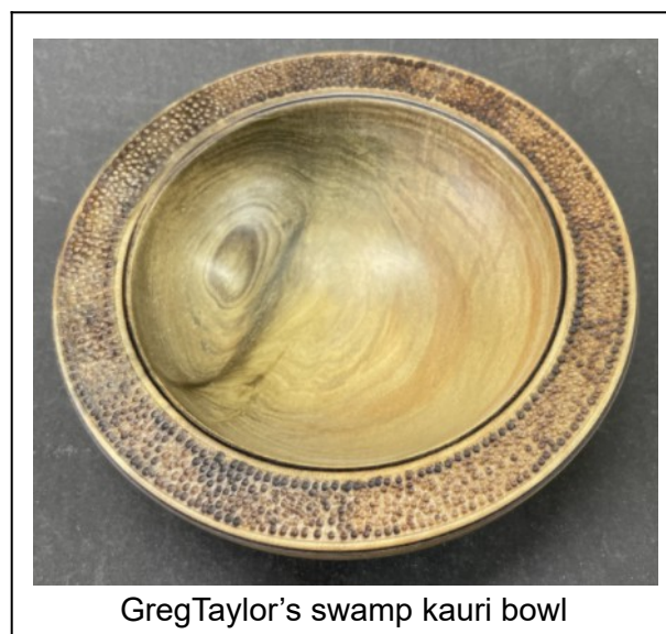
GregTaylor's swamp kauri bowl

Our project to work on for next month is a platter of your own choice.