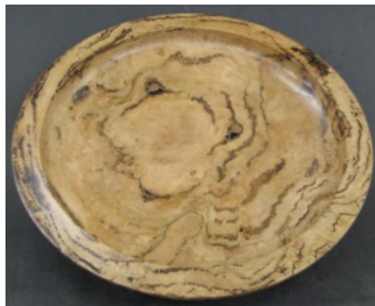
Ian Dawkin's palm wood platter