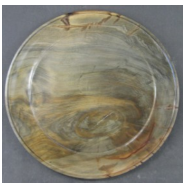
Roy Tregilgas' swamp kauri platter