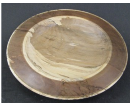
Greg Taylor's platter using white vinegar and steel nails for staining