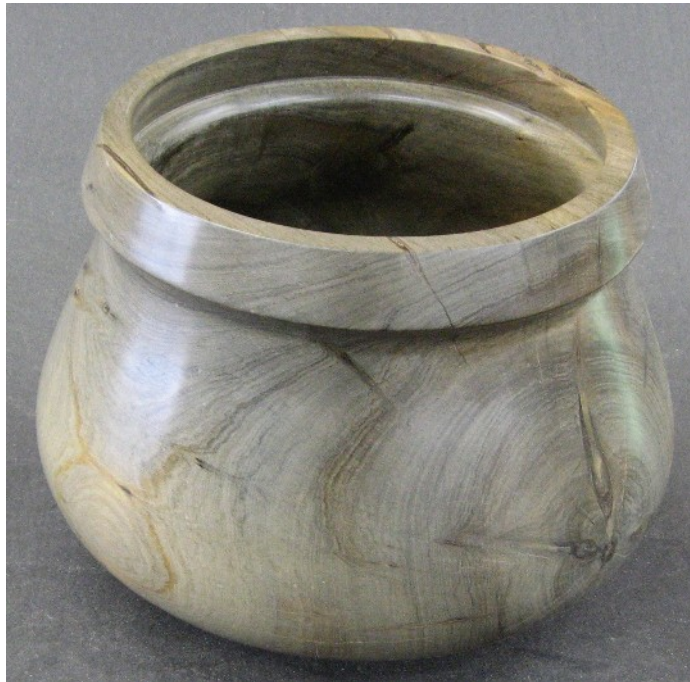
Roy Tregilgas' swamp Kauri pot