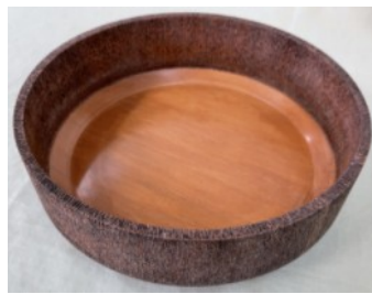
Roy Tregilgas' textured Rimu bowl