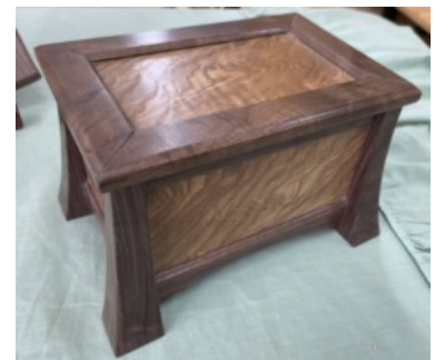
Mike Buck's Black Walnut box