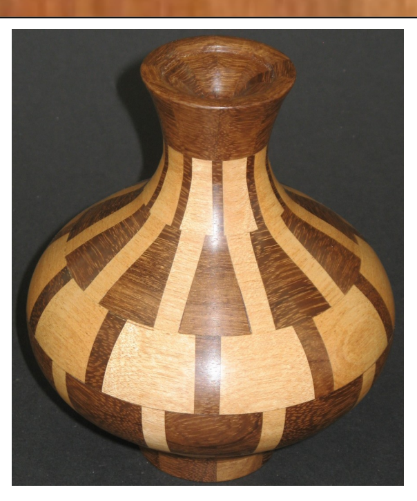
Merv Griffin's segmented blackbean and oak vase