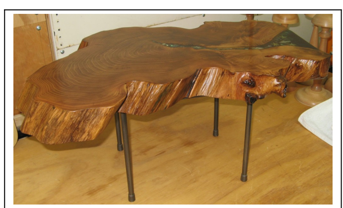
Roy Tregilgas described the trials of adding the epoxy "river" to his acacia side table