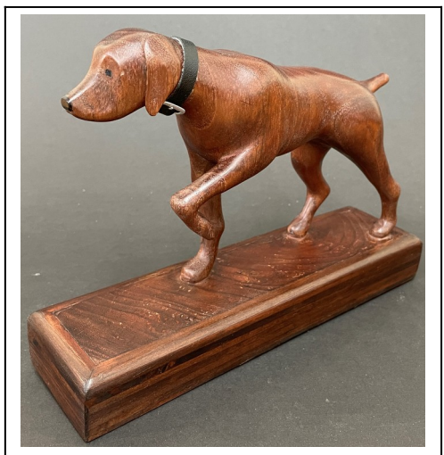
Frazer Pengelly's beautifully finished German Pointer

Two of the items for critique this month are pictured below.