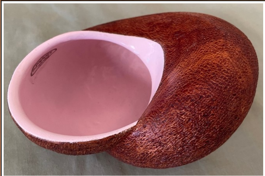
Derek Kerwood's beautifully finished snail shell