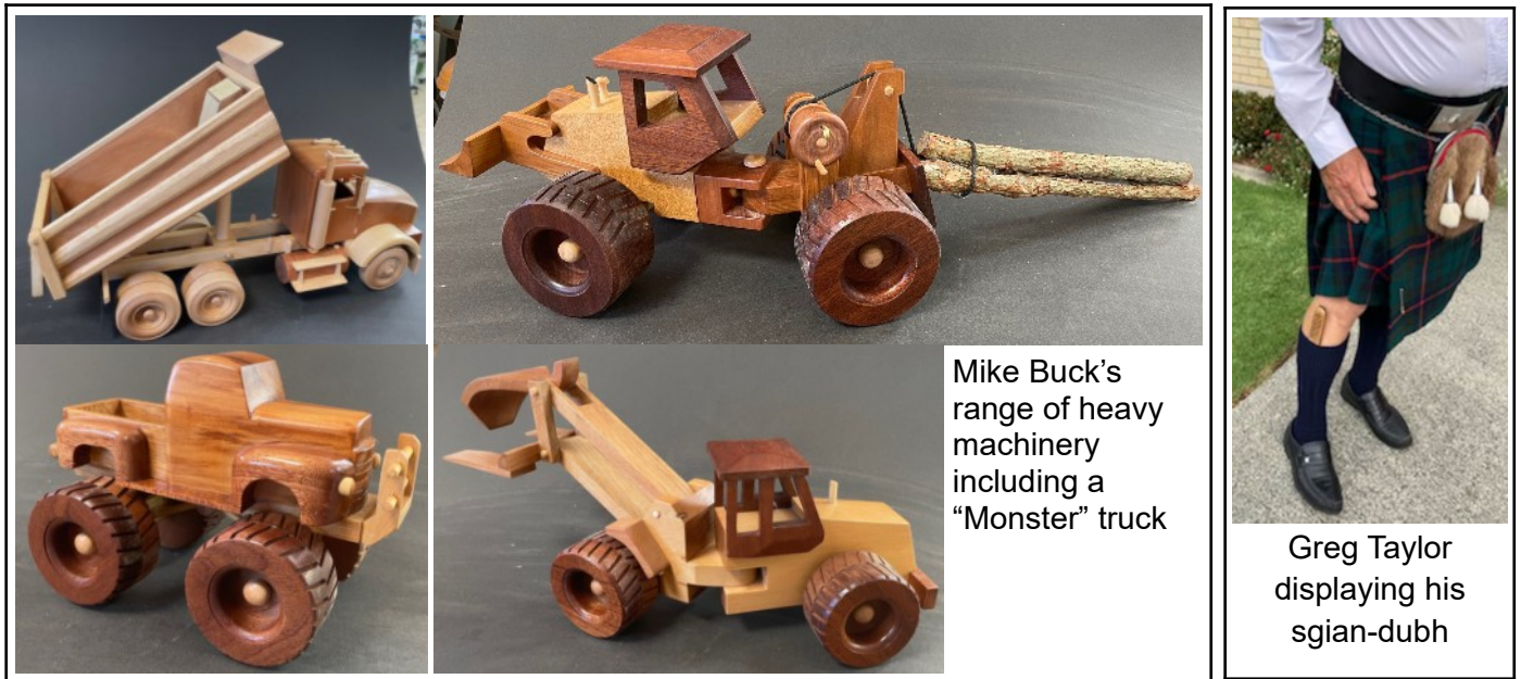
Mike Buck's range of heavy machinery including a "Monster" truck