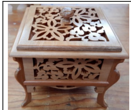
Jacob's finely fretted box