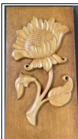
Frazer Pengelly's relief carving of a flower