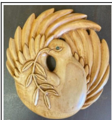
Stephanie Simpson's dove

Our members have been busy with their projects over the summer break and some fine projects were on display.