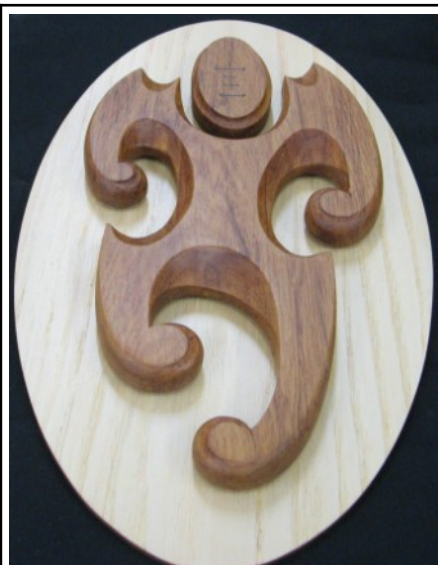
Frazer Pengelly's rugby player