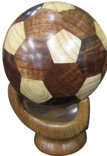
Derek Kerwood's tour de force turned soccer ball