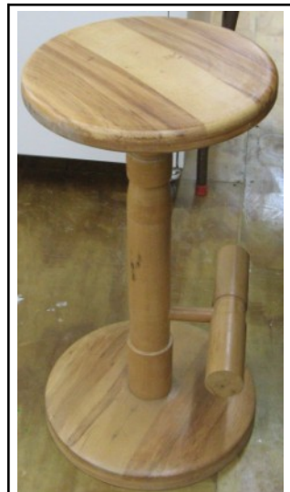
Colin King's adaptable stool