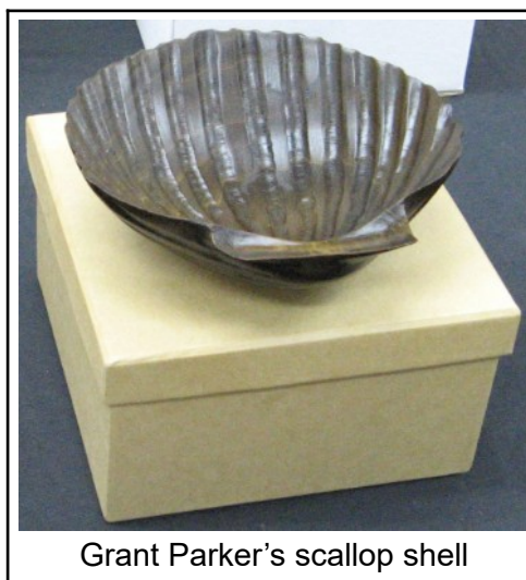
Grant Parker's scallop shell