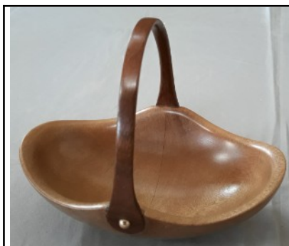
Derek Kerwood's basket

Projects on display included those below.