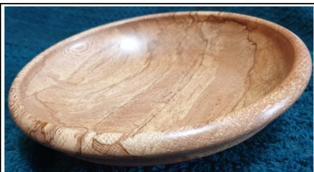
Donna Stemmer's bowl

Things are continuing as usual but with rather more people attending the Saturday sessions. Please note that due to the Scrollsaw Workshop there is no Open Workshop on the 10 th of April.