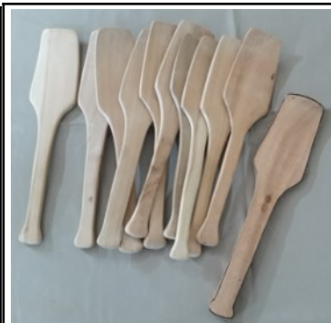
Roy Tregilgas' semi-finished spoons