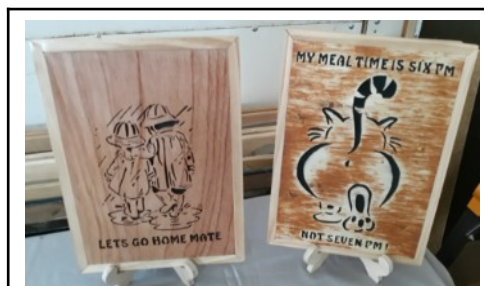
Duncan Campbell's cartoons