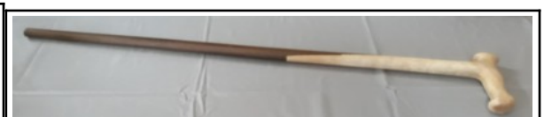
Barwick Harding's carved walking stick