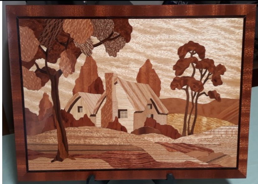
Frazer Pengelly's marquetry cottage finished with wax and gloss polyurethane