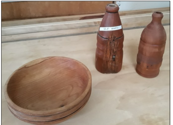
Derek Warth's bowl and sculptural bottles