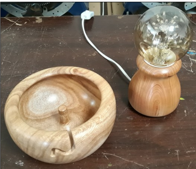
Japie Volschenk's yarn bowl and LED lamp