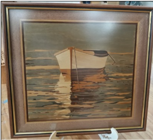
Jacob's exquisitely pieced boat on the water.