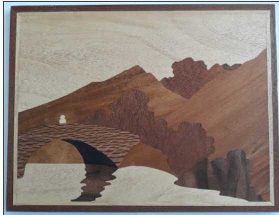
Allan Curtis' beginner marquetry landscape.