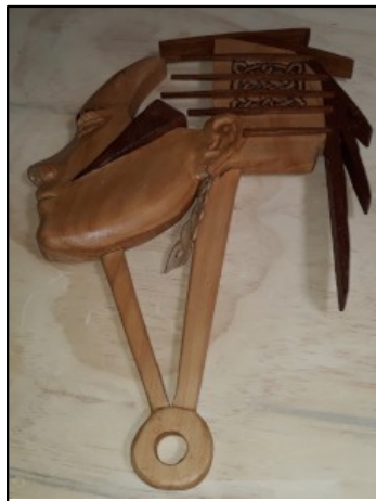
Phil Hansen's abstract head complete with mammoth tusk earring