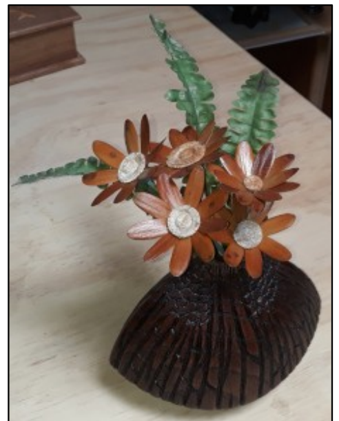
Derek Kerwood's turned and carved vase with flowers made from Kauri leaves (the fern leaves are plastic for effect)