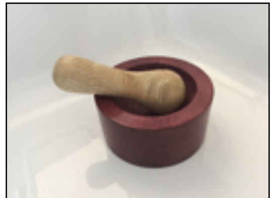
Mortar & pestle - Purple Heart & Hickory