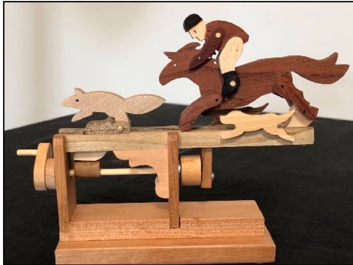
Jacob brought three "executive toy" items along to the March 2019 critique and these were collectively selected as the work of the month.