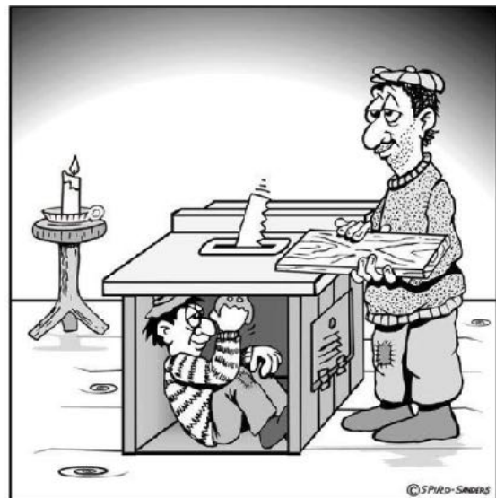
Early attempts at the table saw.