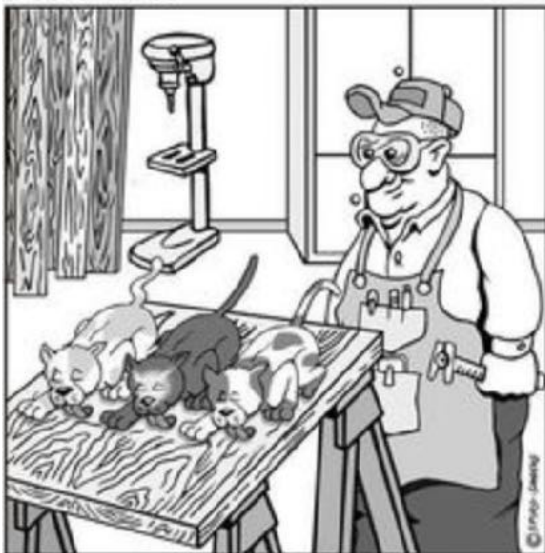
Unable to afford sander, Ned still saved valuable time With his team of 80 grit cats.