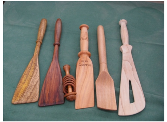
Group 4 Spatulas Sorry, I don't remember who did this beautiful bowl.