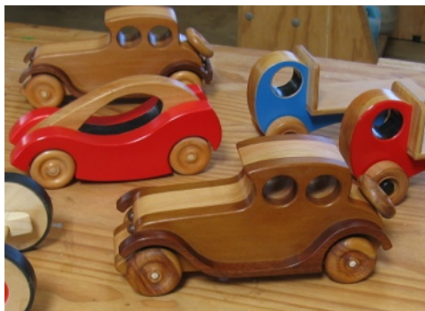
Some samples of Mike's Toys