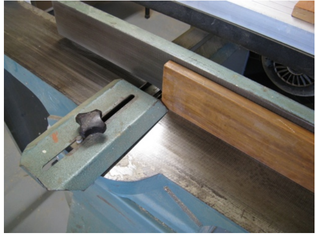
Buzzing an edge SAFE Bridge Guard in place Only the blade being used is exposed