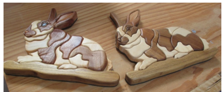
Group 5

There was no Scrollsaw meeting on Wednesday April