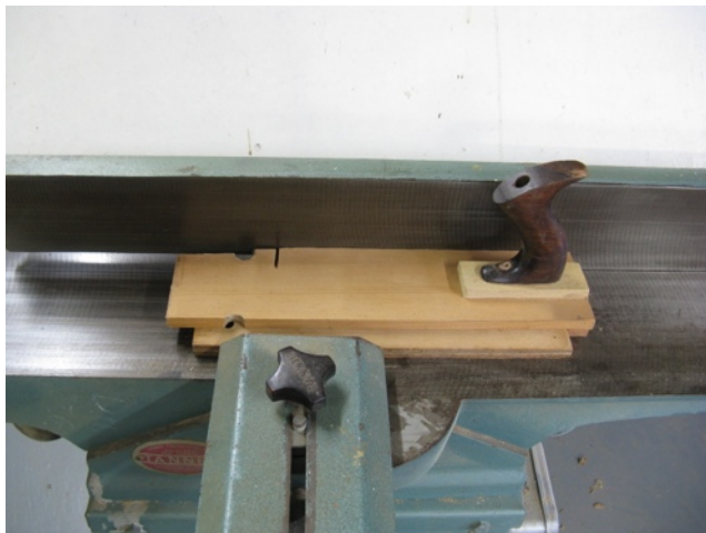
Buzzing a face SAFE A short piece can be safely buzzed using a Push Stick, which keeps hands away from the blades