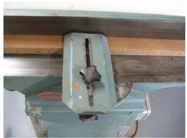
Buzzing a face SAFE The Bridge Guard can be placed so that a long piece long piece passes under it

Side view of a Push Stick suitable for use on the Buzzer. Note the "hook" at the back end, which engages the workpiece. This one is made with an old plane handle.