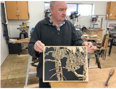
Two items of Bob's latest work - a Cat and an Owl flying inside a pine forest.