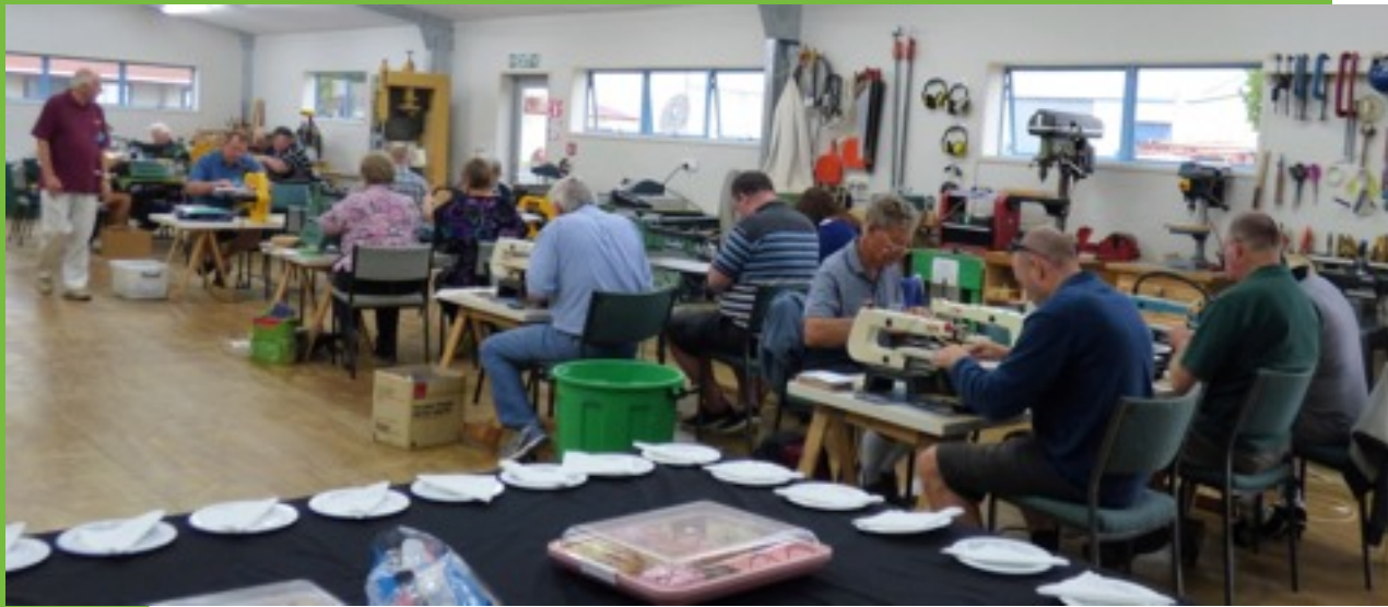
Our seventh annual Scroll-saw Workshop was a great success, and showed the versatility of our new workshop.