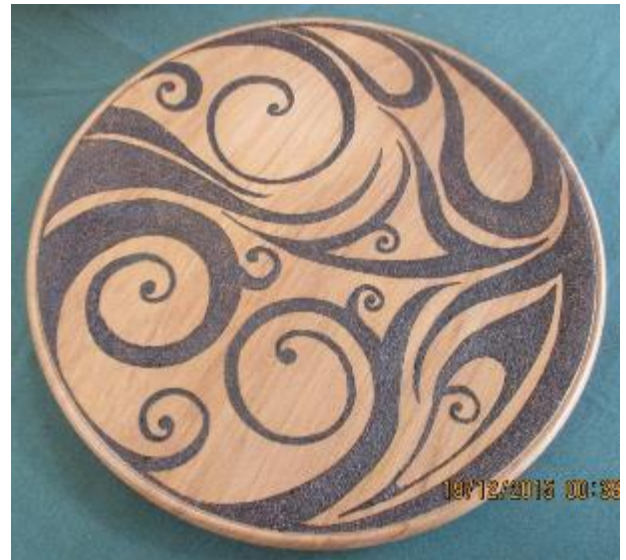
A ornamental tray by Roy Tregilgas