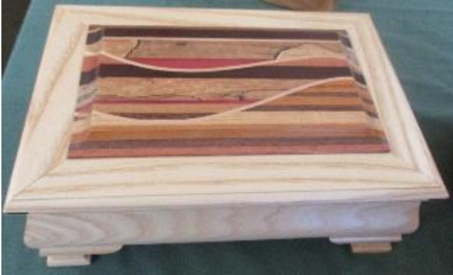
A very nicely finished box by Mike Buck

Critique; Our display table had some very nice articles on it again as usual. Derek Kerwood to comment on them, see pictured below.